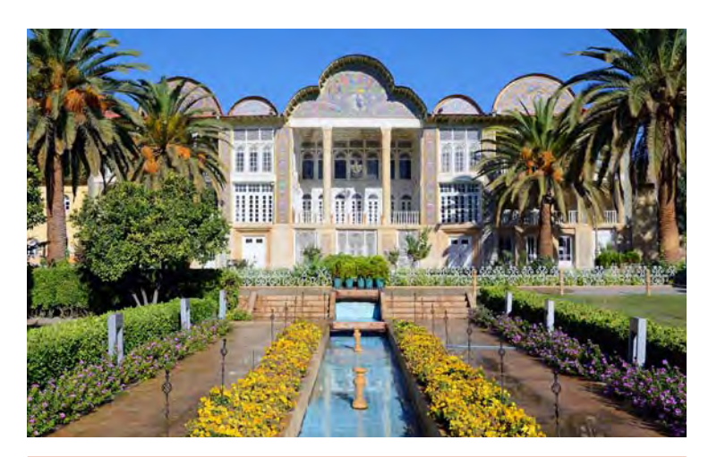
April 2: Sunday. Shiraz.