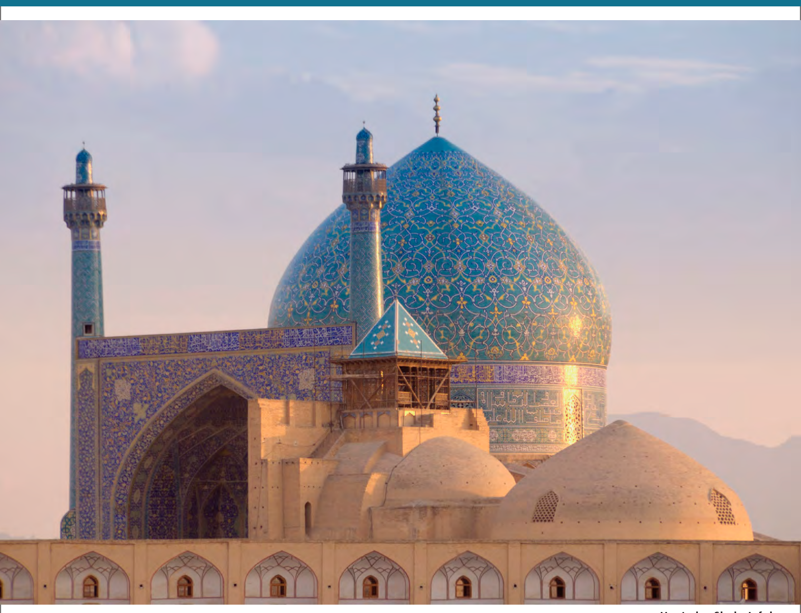
Masjed-e Shah, Isfahan