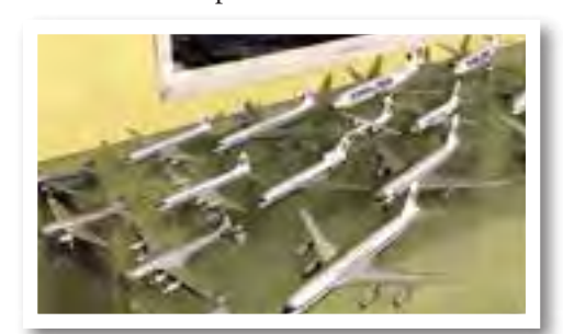
Bob's collection of model Pan Am airplanes

o you remember the good old days when family and friends would gather to play a real (not virtual) board game? In Pan Am - The Game, players take control of their own fledgling airline and compete with Pan Am to create an airline empire. They bid for lucrative landing rights to build a route system. They buy aircraft and airports to compete with the ever-growing Pan Am. Players earn income from operating and selling routes to buy Pan Am stock. The players with the most stock at the end of the game wins. "It's a game of global strategy that spans four decades of industry-changing historic events and technological achievements, in which every timeline is different," according to Funko Games, publisher.